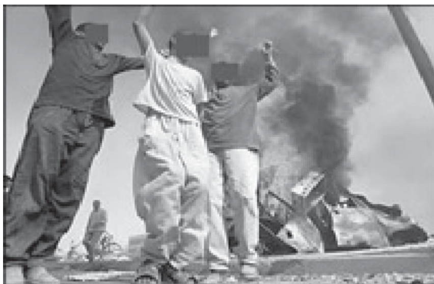
Iraqi civilians celebrating victory of the Iraqi resistance fighters against US forces

Interestingly, criticisms and calls for change coming from the Washington corridors of power were also