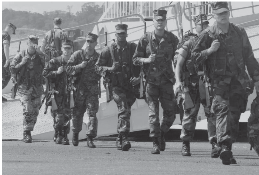
US Marines arrive at the former US naval base in Subic, Zambales, in northern Philippines, from their High Speed Vessel, for the "shoulder-to-shoulder" joint military exercise.

This Anti-Terrorism Bill, just like the US Patriot Act and the US Military Commissions Act, must be vigorously opposed by the Filipino people and all freedom-loving peoples. ■