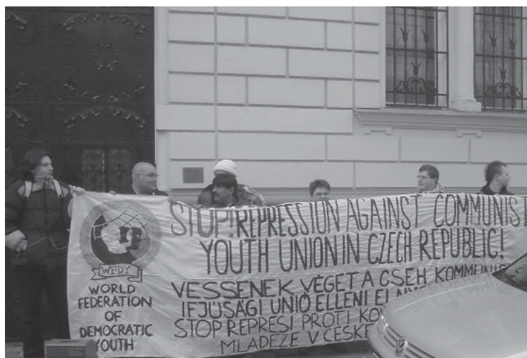
World Federation of Democratic Youth protests repression of KSM

The KSM declared that it will challenge the interior ministry's decision in court.