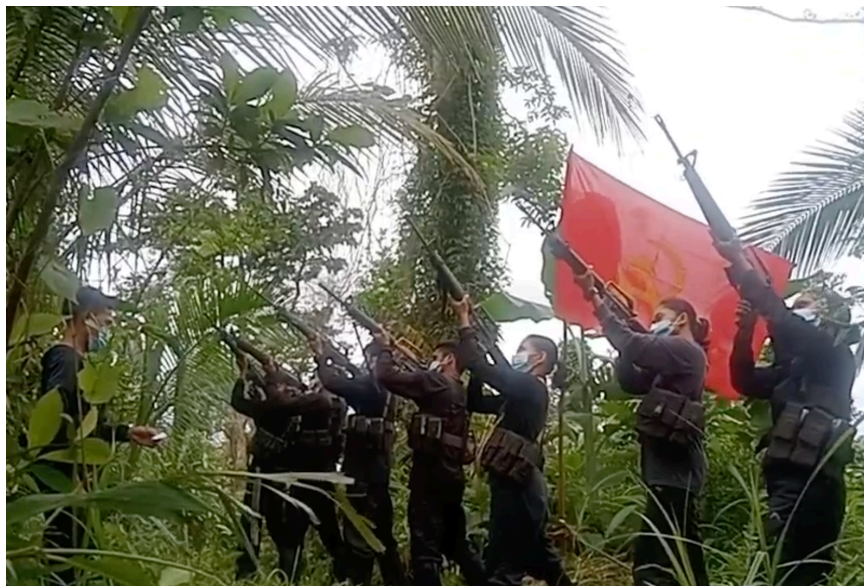
NPA fighters from Central Luzon take in their a 21-gun salute for Ka Joma

prohibition against foreign military bases and forces in the Philippines by making the Enhanced Defense Cooperation Agreement to allow the US military forces to have exclusive bases and facilities within the camps and military reserve areas of the reactionary armed forces. But now, the US is conspicuously locked in a contest with China to plunder the natural resources of the Philippines and the rest of ASEAN.