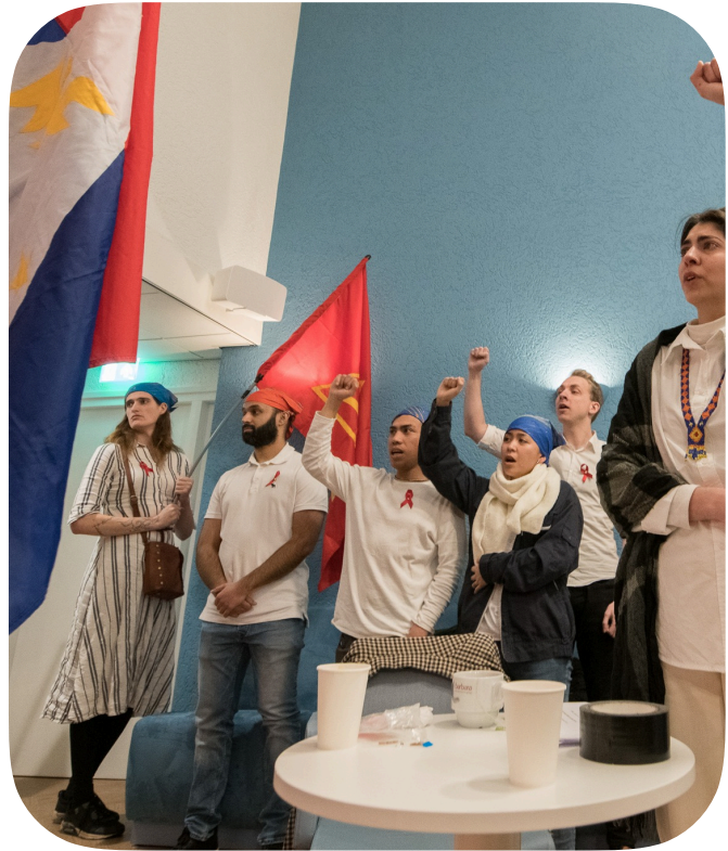
Tribute with international friends in Utrecht, December 23, 2022

The 2008 financial meltdown has developed into a global depression far more prolonged and severe than the Great