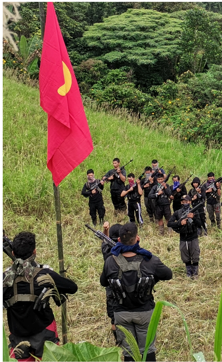
Red fighters pay tribute to Ka Joma, December 19, 2022

At every major shift of its economic policy in East Asia, US imperialism has always made it a point to prevent the economic development through a