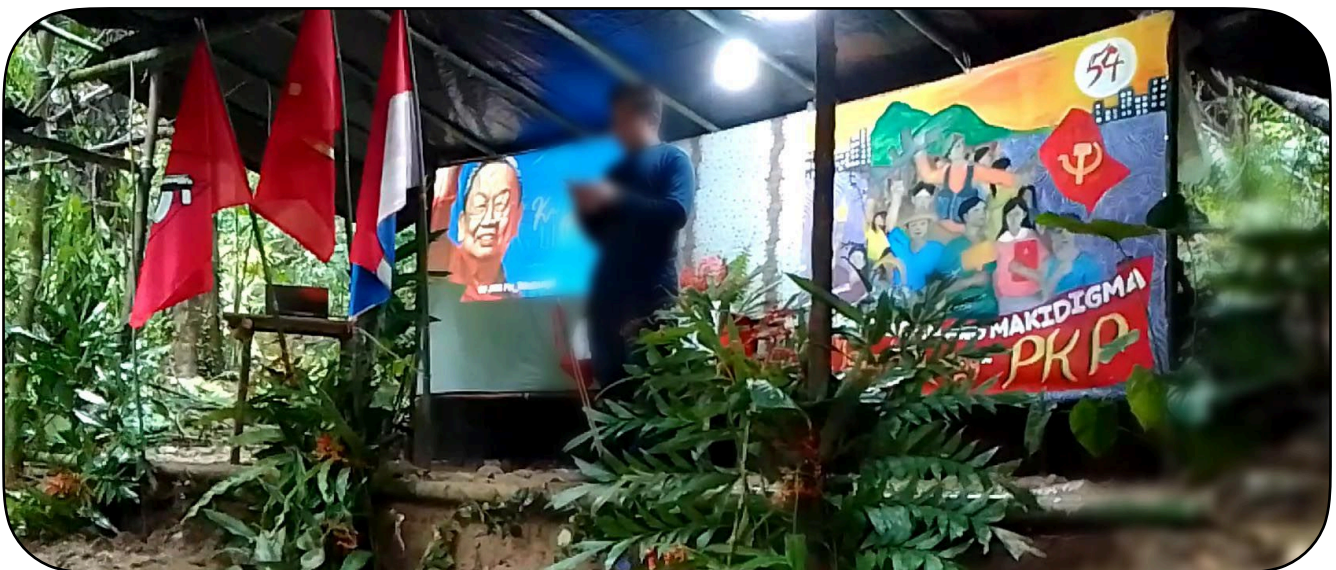
Comrades from Bicol hold a program to give tribute to Ka Joma

Up to the early 2000s, he also played a lead role in the formation of the International Conference of Marxist-Leninist Parties and Organizations (ICMLPO) which serves as a center for ideological and practical exchange among