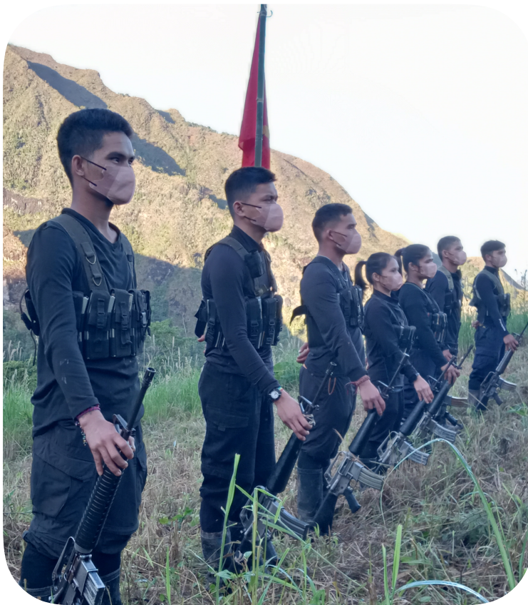
NPA fighters from North Central Mindanao stand in attention to render a 21-gun salute for Ka Joma

As the advanced detachment of the proletariat, the CPP has made great achievements in its ideological, political and organizational work. It has been guided by the theory and practice of Marxism-Leninism-Maoism and has applied it on the history and current social circumstances of the Filipino people. It has put forward the general line of people's democratic revolution with the strategic line of protracted people's war and with the socialist perspective. It has upheld the principle of democratic centralism and has built a nationwide organization that is well integrated with the toiling masses of workers and peasants and the rest of the people.