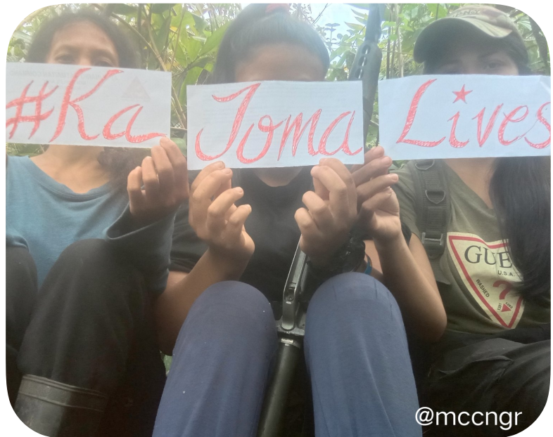
Red fighters from Negros Island celebrate Ka Joma's life, December 19, 2022

It is absolutely untrue that the people's revolutionary forces are dwindling and being defeated and that the Red cadres, commanders and fighters—all tested and tempered in more than 54 years of victorious people's war—are rapidly being killed or captured in focused military operations or surrendering because of such band-aid offers like the graft-laden Enhanced-Comprehensive Local Integration Program, Community Support Program and Barangay Development Plan. And yet the ruling clique and its military minions keep on demanding more public funds not only to attack the people but also to pocket the larger part of the military budget.