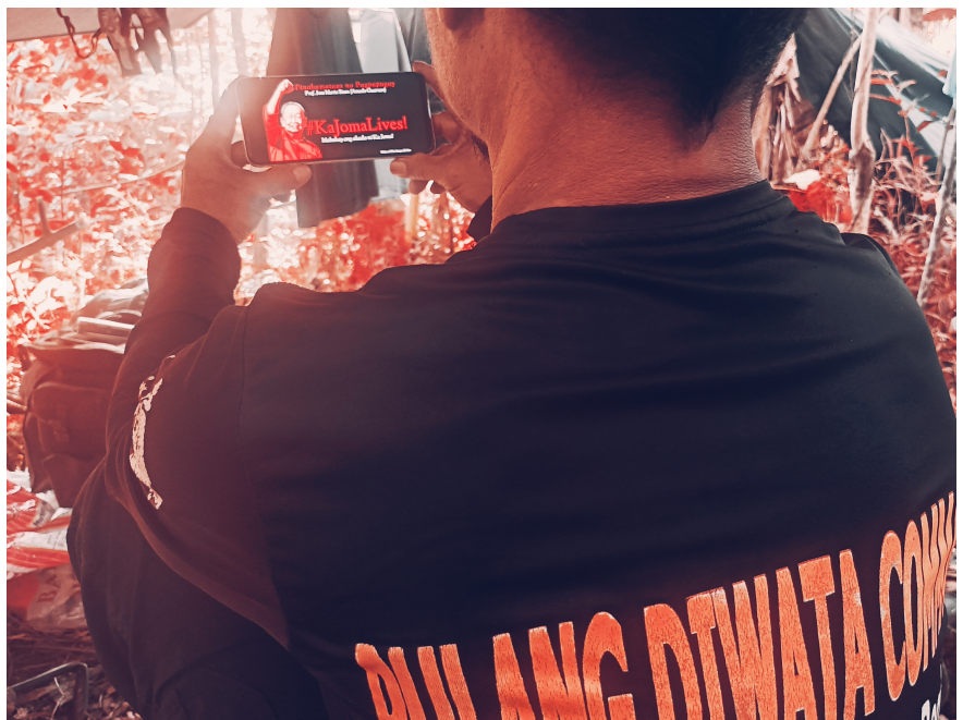
A Red fighter in Northeast Mindanao receives news of Ka Joma's passing

The limits of US imperialist power have been exposed by its failure to take over the oil resources and build 16 military bases in Iraq, to destroy the Syria-Russia-Iran alliance, to break the revolutionary struggle of the Turkish and Kurdish people and to hold on to Afghanistan surrendering