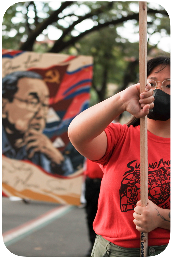
People's organizations march inside UP-Diliman to pay tribute on December 19, 2022

When the encamped enemy tires out and retreats, it is the turn of the NPA to make the advance and deliver more offensive blows. But even while the enemy seems to have the upper