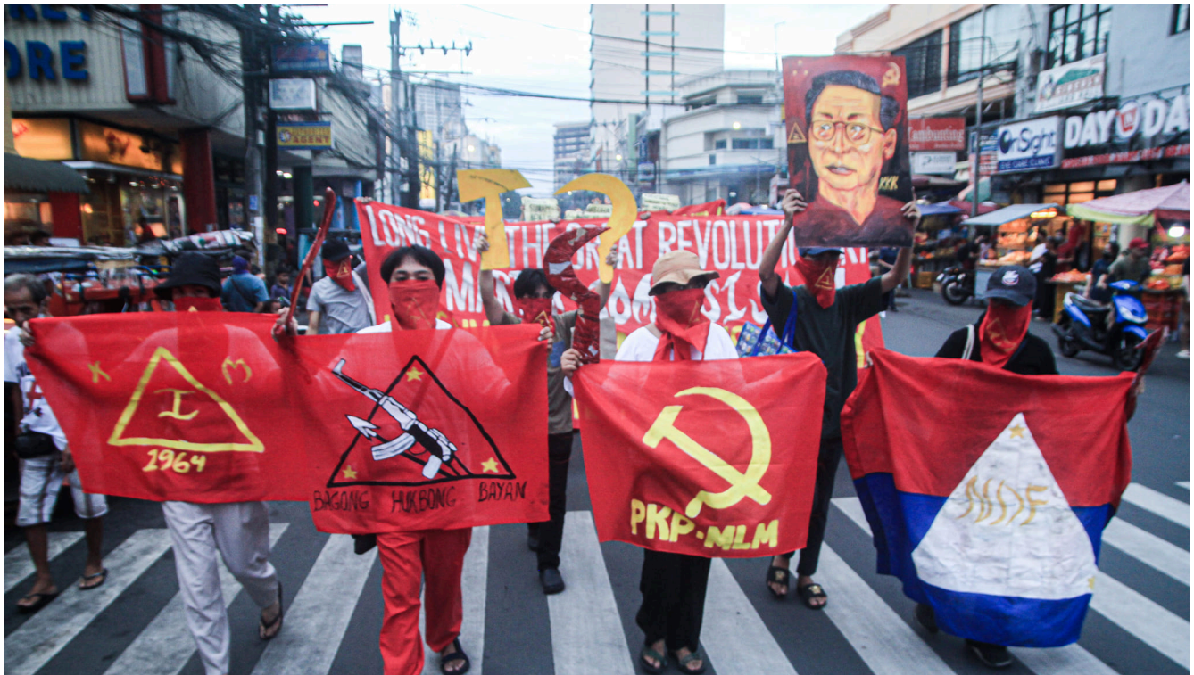
Kabataang Makabayan members stage a lightning rally in Manila to honor Ka Joma on December 21, 2022

Guide to Land Reform in September 1972 which both served to direct the work of building the mass organizations, organs of political power, units of the people's army and the Party, as well as in mobilizing the peasants in waging agrarian revolution. He authored the Preliminary Report on Northern Luzon in August 1970 which served as a template in the work of other regional committees.