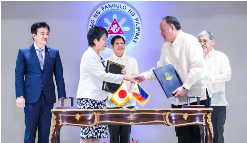
The Philippines and Japan sign the Reciprocal Access Agreement in Malacañang on July 8, 2024.

Through the RAA, the Marcos regime will allow Japan to heighten its intervention in the Philippines in exchange for the provision of military equipment, as well as promises of investment and loans for neoliberal programs and policies. It also further binds the country to the imperialist belligerent alliance led by the US. It will further undermine the country's ability to independently assert its own interests and aspirations.