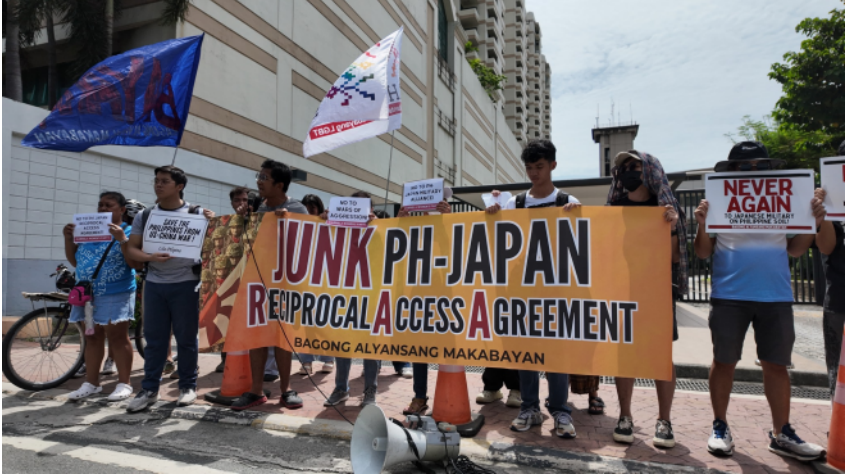
Bagong Alyansang Makabayan (Bayan) leads protest action at the Japanese embassy in Pasay City on July 8 against the PH-Japan Reciprocal Access Agreement.